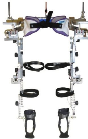
Figure 1: Lower body exoskeleton.

Abstract — The Robotic Gait Rehabilitation (RGR) Trainer was designed to address secondary gait deviations in stroke survivors undergoing rehabilitation. Forces generated by an impedance-controlled actuator are transferred to the subject's lower body via a lower body exoskeleton. In this paper we describe the RGR Trainer's position measurement system and the sensing technology in the exoskeleton. We demonstrate the complete system's ability to record the subjects' pelvic obliquity patterns (both normal and hip hiking), which is possible due to the RGR Trainer's highly back-drivable actuation system and the exoskeleton's effective adherence to the pelvic region and lower limbs.